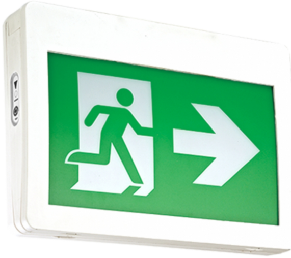
#989 - LED EX100-SP