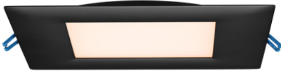
Type IC, Wet & Air-Tight