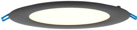
Type IC, Wet & Air-Tight